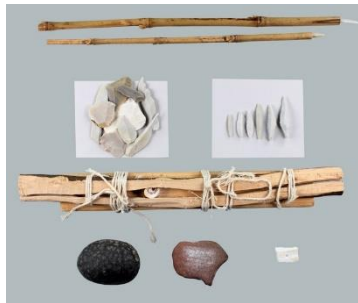
Figure 5 is great! Note that a vise can be made with wood and string:

Line 130: “perforation performance” should be “perforation effectiveness.”