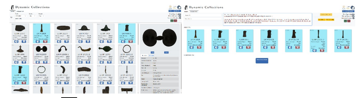
Figure 1 online platform, showing all the objects in the archive, with details and metadata (left) and an annotated collection (right).

Ideally, a digital collection must be something more than just a list of 3D models with some attached metadata. It should be able to include all those elements that might be used by scholars and teachers to effectively employ those objects in their everyday work in a cohesive and structured way; elements such as notes, reasoning elements, object-specific annotations, cross-links between entities, schemes, etc.