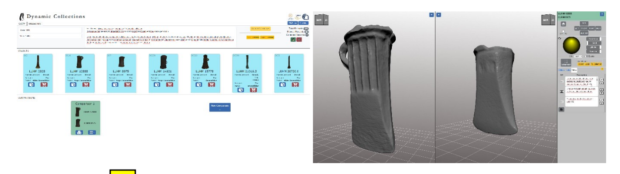
Figure 3 new "comparison" entity in the collection can be used to create side-by-side multiobject visualisation and annotation.

The new comparison functionalities are currently in an advanced stage of development and their first version is being tested, and will be made available to all users soon.